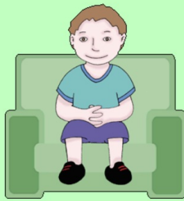
He is sitting.