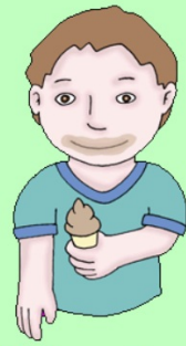
He is eating.