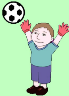
He is playing football.