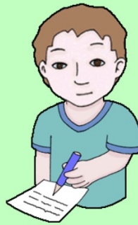
He is writing.