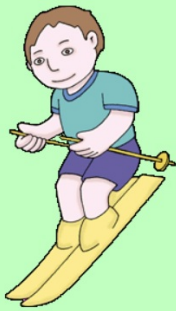
He is skiing.