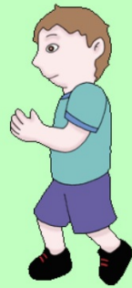
He is walking.