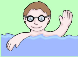
He is swimming.